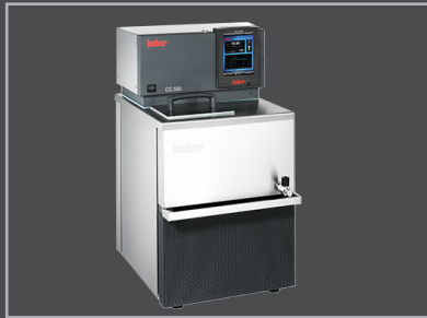
TEMP CONTROL - HUBER CC-508