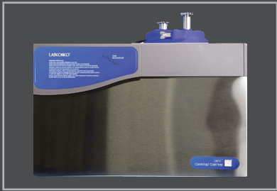
-105°C COLD TRAP - MAXTRAP105