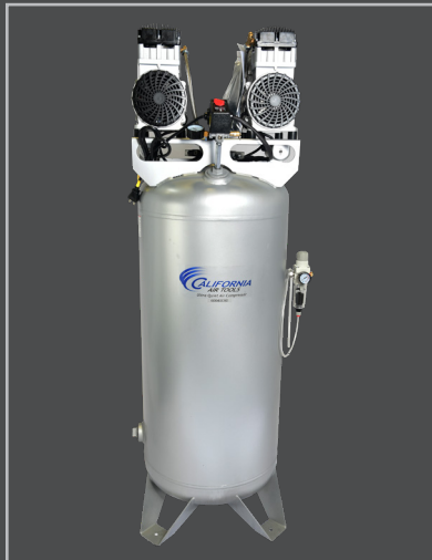
AIR COMPRESSOR 60040CAD