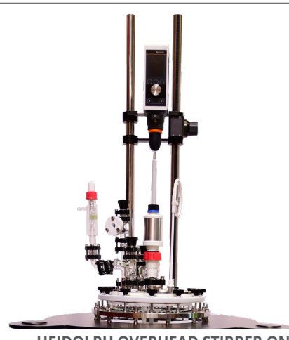
HEIDOLPH OVERHEAD STIRRER ON HEIGHT ADJUSTABLE FRAME