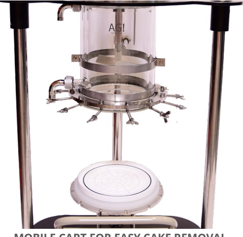
MOBILE CART FOR EASY CAKE REMOVAL