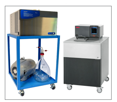
MOBILE CART WITH COLD TRAP, VACUUM PUMP, CARBOY, AND TEMP CONTROL

Cascade Sciences' Filter Reactor Packages are complete systems for isolate production or other reactions. The reactor, filter housing, and vacuum/temp equipment are integrated into mobile carts.