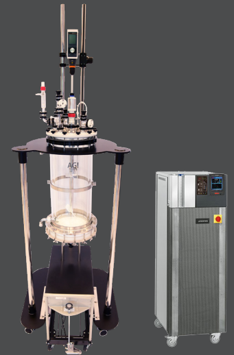
Winterize & Filter Crude 50L Filter Reactor with Huber Unistat 815

503-847-9047 sales@cascaDESCIENCES.COM cascaDESCIENCES.COM