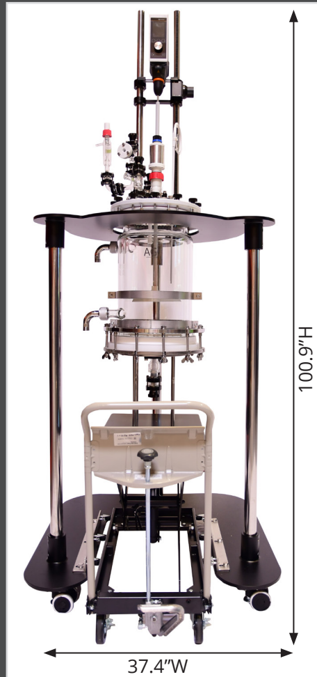
20L FILTER REACTOR