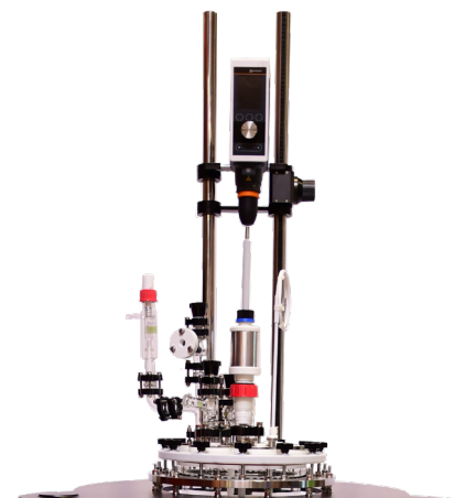
HEIDOLPH OVERHEAD STIRRER ON HEIGHT ADJUSTABLE FRAME