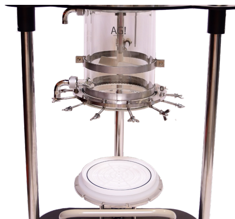
MOBILE CART FOR EASY CAKE REMOVAL